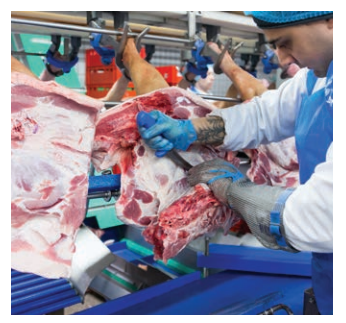
More "knife in meat" time