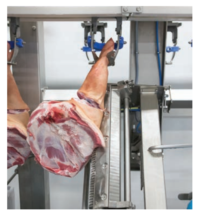
In line de-skinner