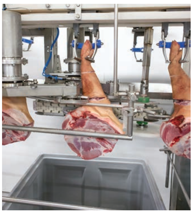
Shank pre-cutting module