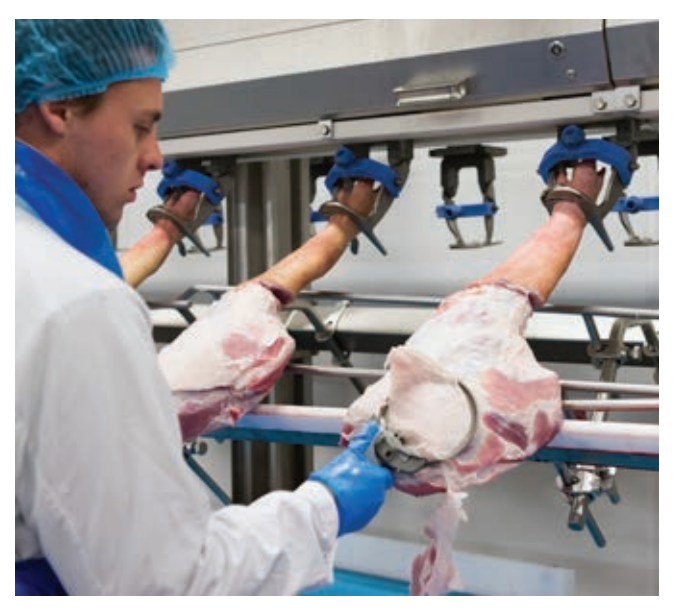
Focus on one task