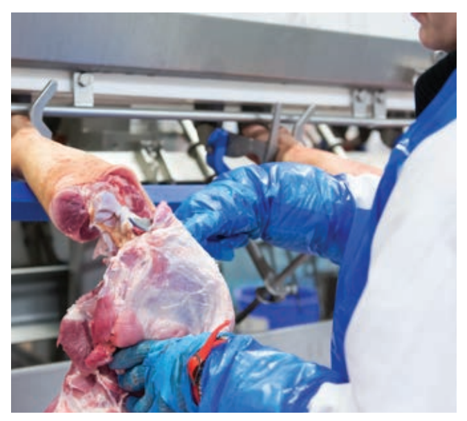
Fore- end gripped firmly in carrier

DeboFlex is a groundbreaking new solution from Marel for deboning pork fore-ends and legs. Current pork deboning technology is based primarily on pace lines where products are transported on a belt in a random, sometimes chaotic flow and worked on by highly skilled staff.