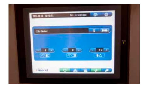
Advanced touch screen panel for easy operation