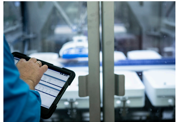
Significantly reduces the need for labor