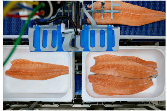
Minimizes giveaway in fixed-weight boxes

The innovative system's robotic arms virtually eliminate manual handling from the packing process, significantly optimizing product quality and hygiene. Its extraordinary grippers are designed for gentle product handling, ensuring even the most fragile fish isn't damaged during packing. The unique packing technology manages the flow of boxes, streamlining processing and optimizing throughput and efficiency like never before.