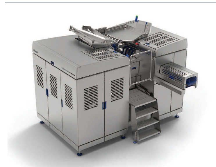
Vison camera enables improved cutting accuracy